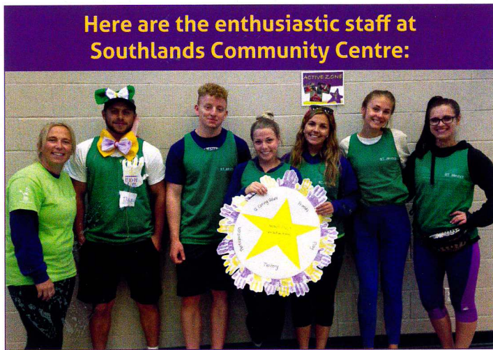
Here are the enthusiastic staff at Southlands Community Centre:

Staff and participants were challenged to wear purple or yellow to the program in recognition of this special day.