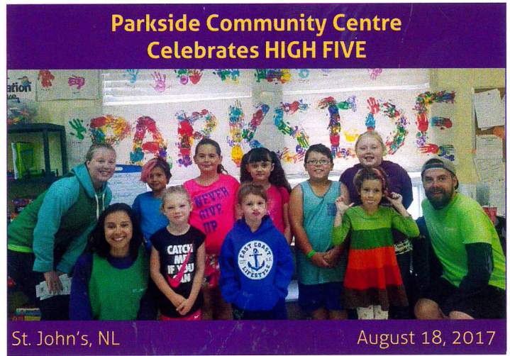
Parkside Community Centre Celebrates HIGH FIVE