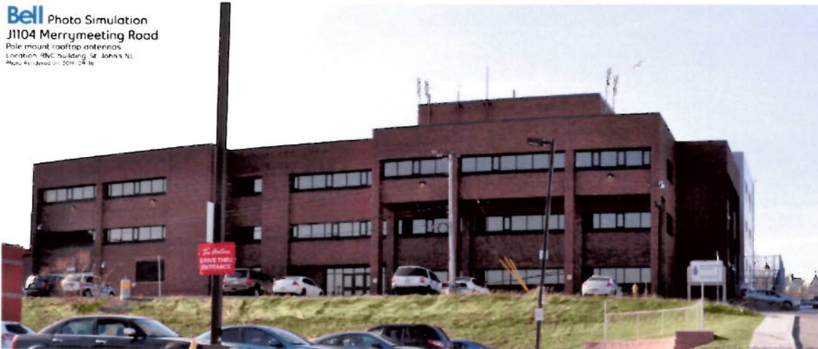
View: from Harvey Road

Photo Simulation is a close representation and is for conceptual purposes only. Proposed design is subject to change based on final engineering plan.