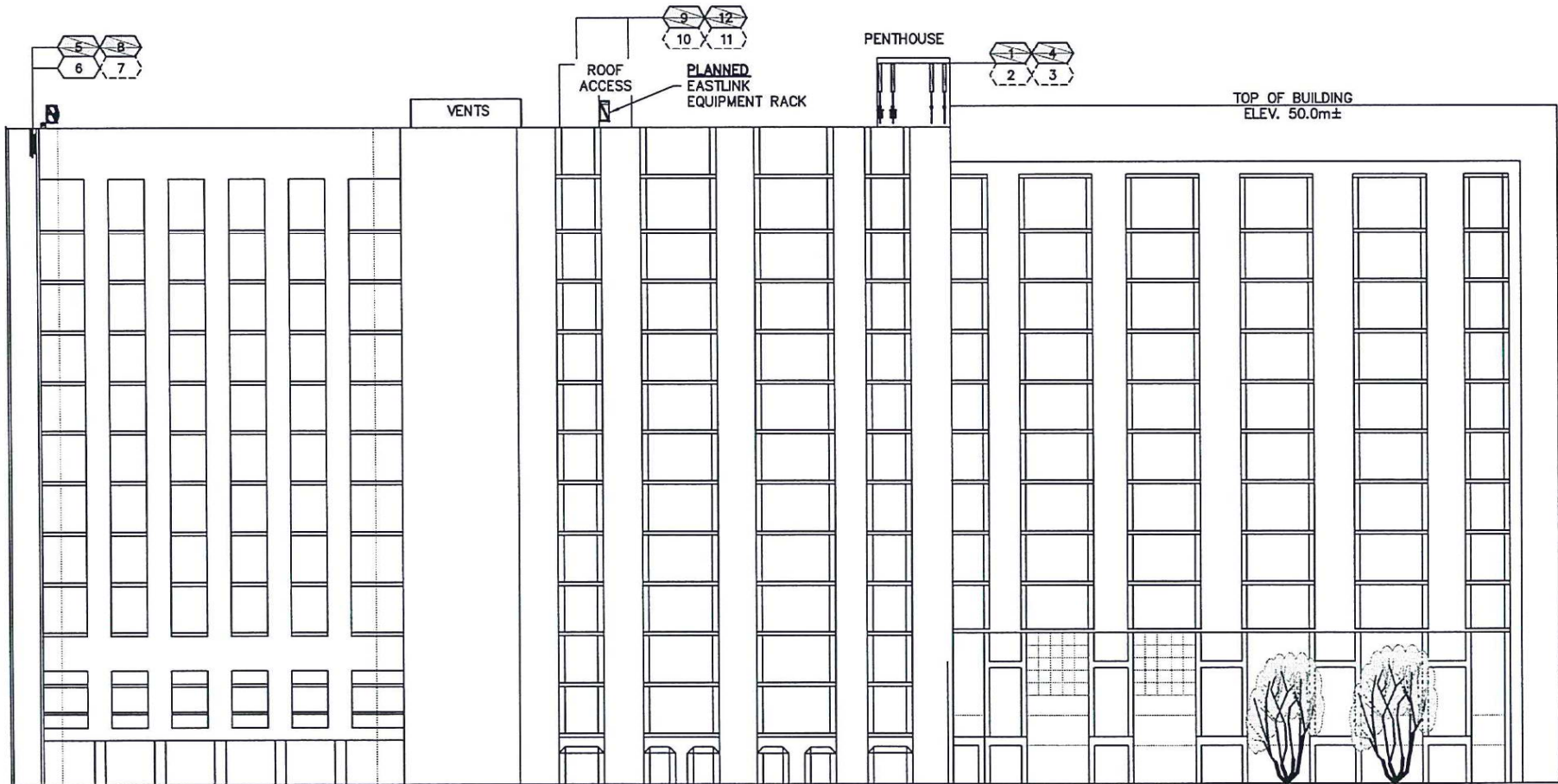
BUILDING FRONT ELEVATION 1:400