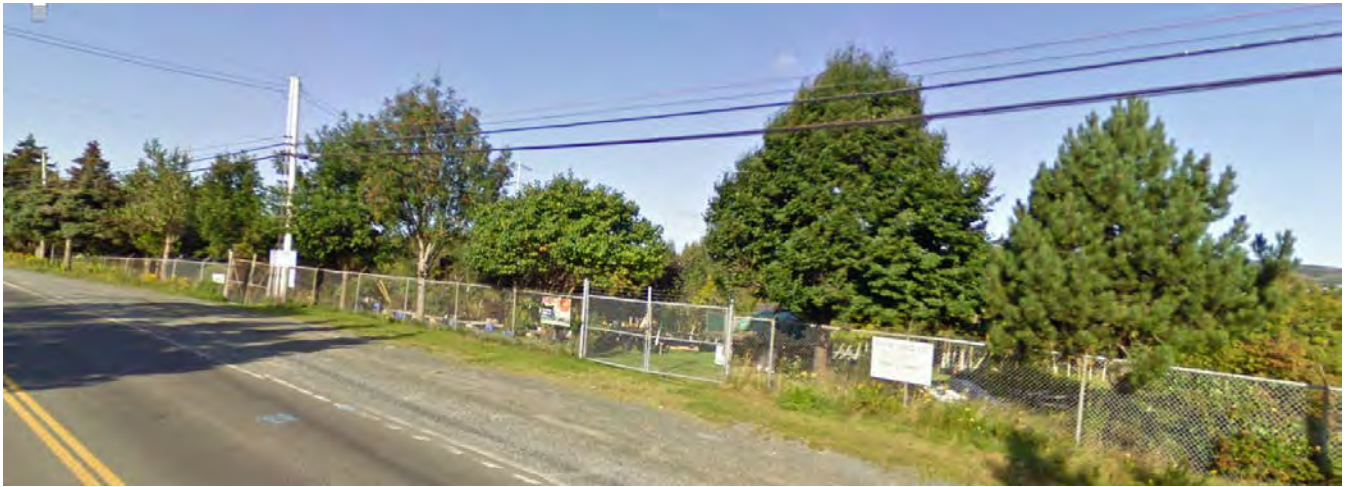
The view of the subject property, looking southwest along Bay Bulls Road.